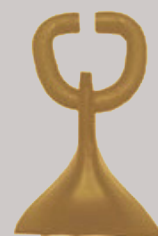
Quick change "ducksfoot" blade