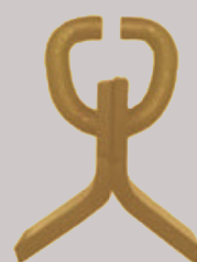
Quick change Y blade